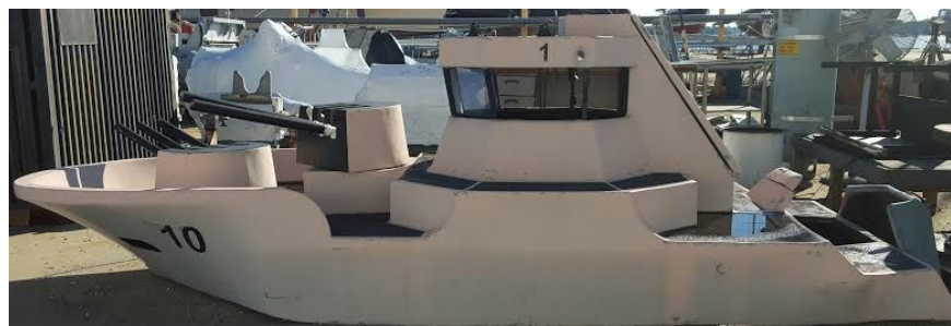
Figure 2. A port side view of the U.S.S. Philo hull that has been separated from the decommissioned chassis.

The team decided to reuse the hull from the previous vehicle (Figure 2) as it was determined to be in good structural condition. A new system is being designed to mate the new chassis with the old hull in a way that will easily facilitate maintenance. The previous version of the U.S.S. Philo featured cannons that could shoot candy and confetti using an air compressor. This year's team has designed a T-shirt cannon that will be retrofitted to the existing hull.